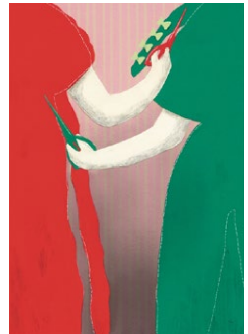
Illustrations for „ A Room of one's own“ by Virginia Woolf » 2020