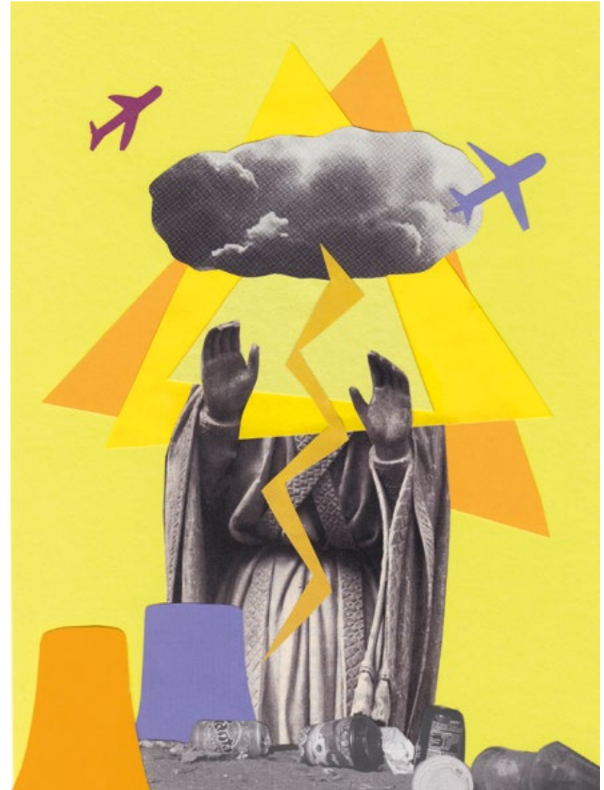
editorial illustration for Transform Magazin about the relationship between spirituality environmentalism » 2020