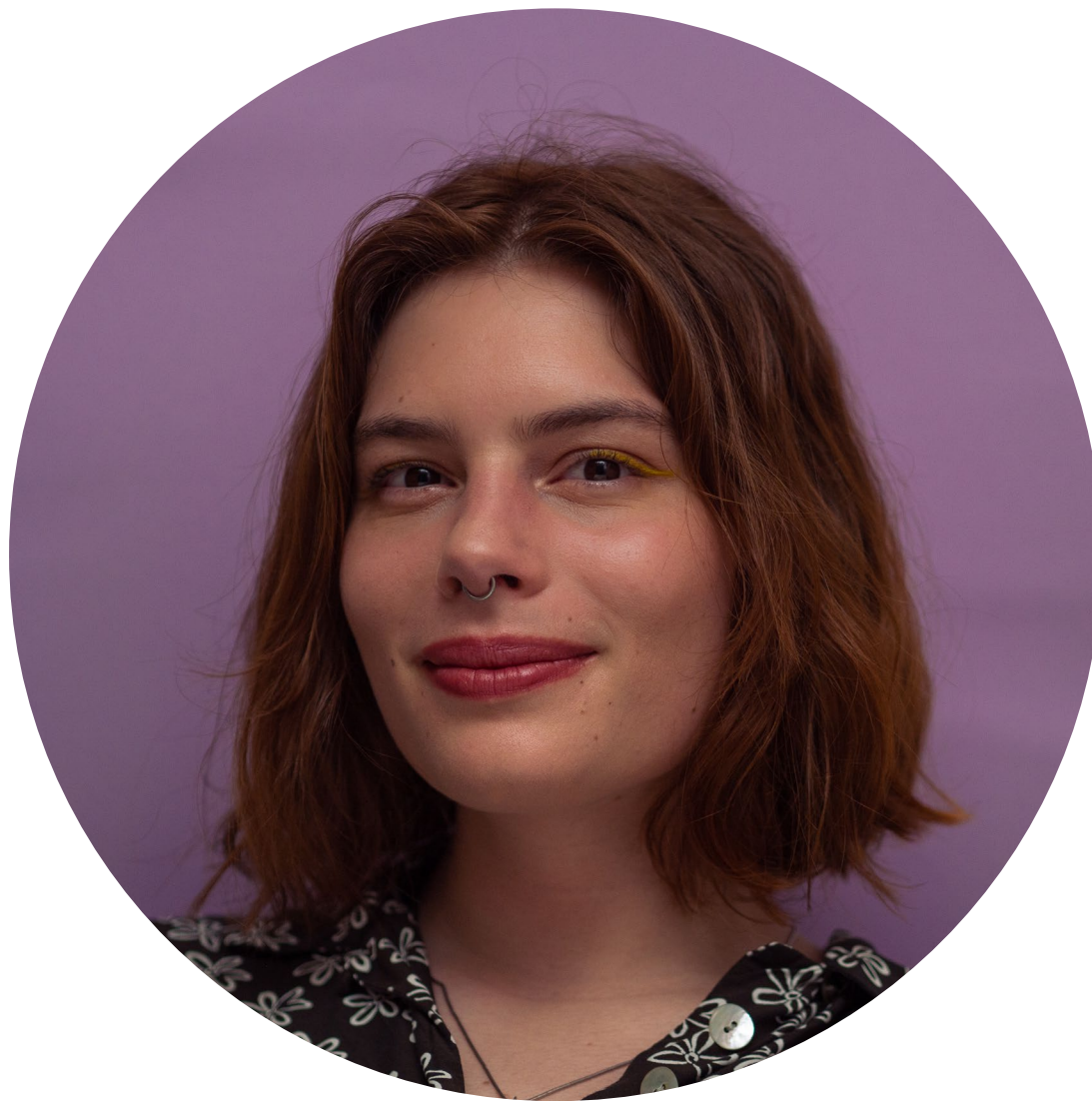
Ælfleda Clackson Illustration

www.aelfleda.com » hello@aelfleda.com » instagram: @aelfleda