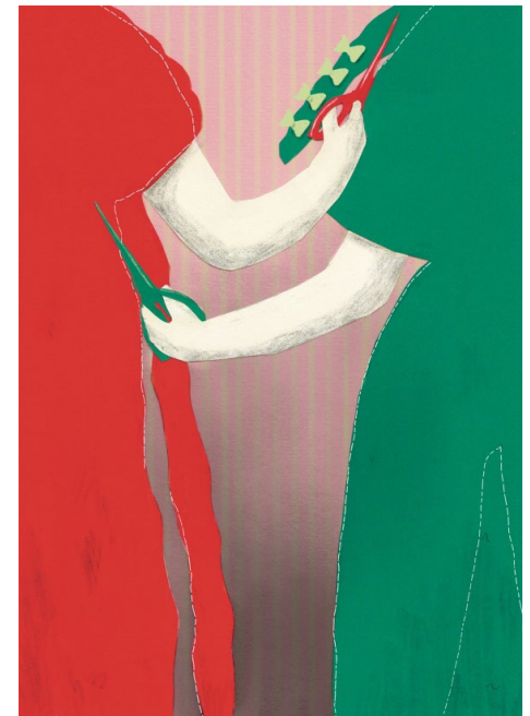
Illustrations for „A Room of one's own“ by Virginia Woolf » 2020