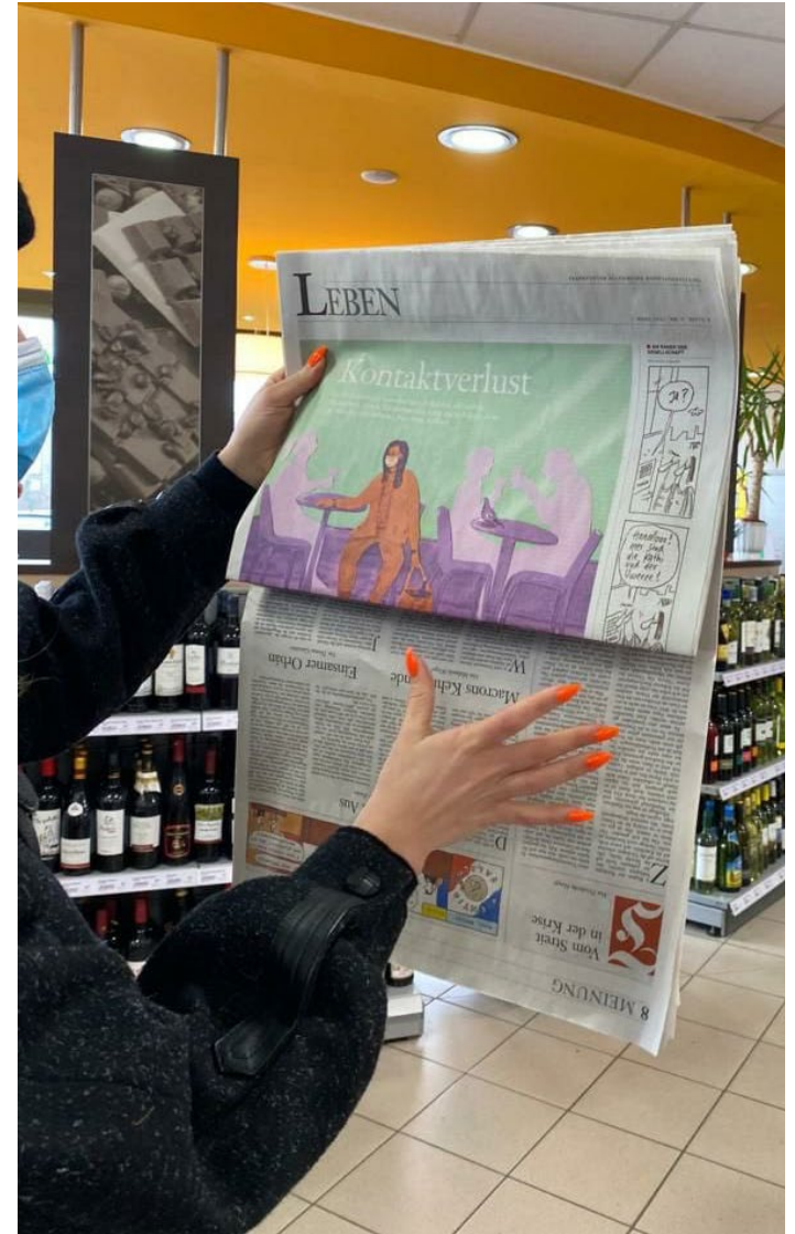
editorial „Kontaktverlust“ for FAS » Paper collage with digital editing » 2021