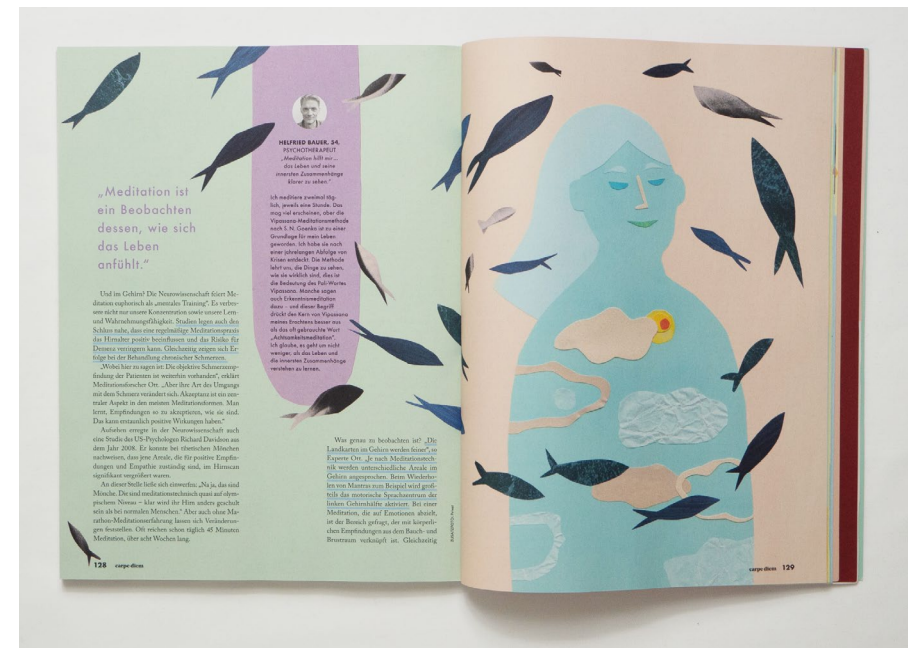
series of illustrations for „Carpe Diem Magazin“ about Meditation » 2021